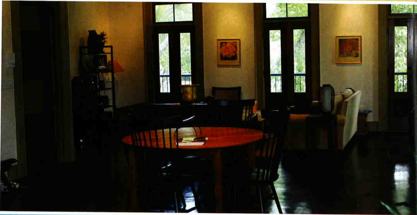
This loft occupies the second and third floors of the most recent commercial building built in Habersham, South Carolina. The balcony overlooks the town center below.

There are two different types of lofts: A hard loft and a soft loft. A hard loft is the traditional residence conformed within some old, historic building that is often full of character and history. A soft loft is what developers are building today to satisfy the increasing demand for loft living. Both hard and soft lofts are characterized by big open spaces, lots of floor-to-ceiling windows, and soaring ceilings. Given their configuration and proximity to urban centers, lofts are a very unique way to live.