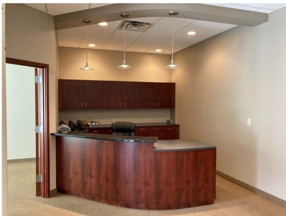
Front entry desk