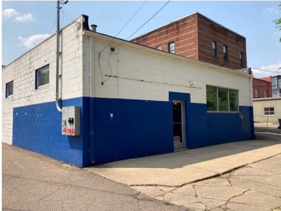
Parking and rear entry