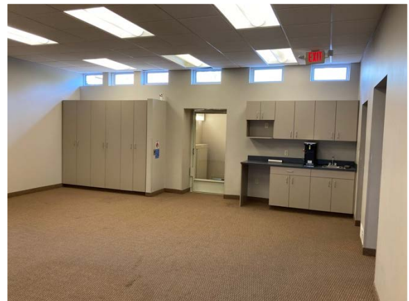
Lower-level offices with efficiency kitchen