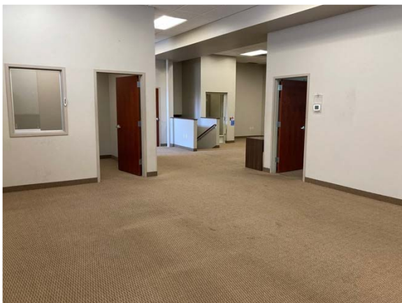
Entry and showroom