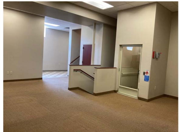
Open floor plan at street level with three private offices