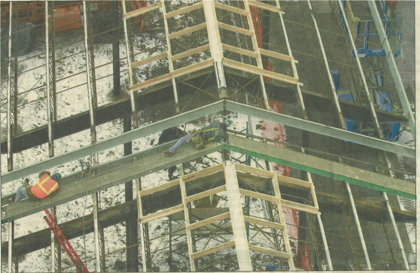
JOE ODEN, PIONEER PRESS